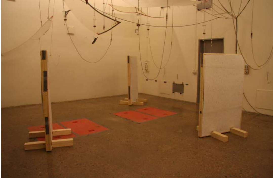
Picture 1- Three test objects were placed in the reverberation room.